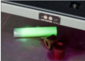
Inspection with the large area lamp under UV light