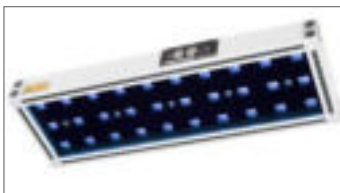
30 UV LEDs provide for a very uniform intensity distribution