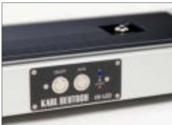
UV LED large area lamp operating panel