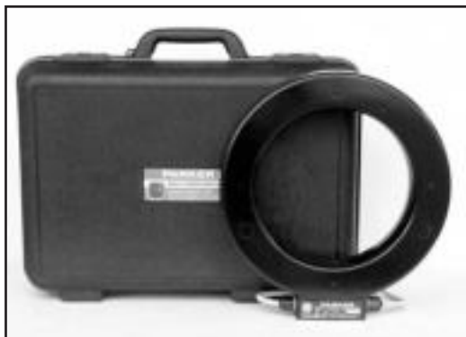
PL-10 WITH CASE