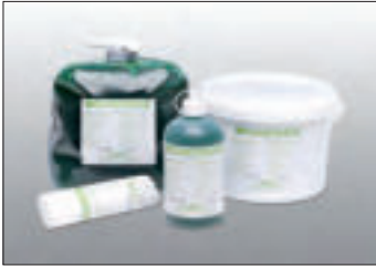
Various package sizes for ECHOTRACE: Indispensable for manual contact testing