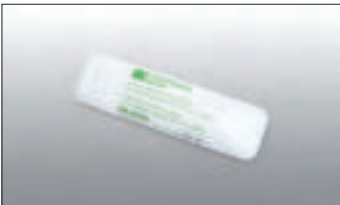
ECHOTRACE high temperature couplant for the inspection on hot surfaces