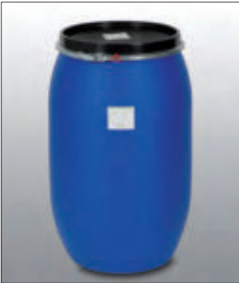
For large quantities barrels of 200 l are provided