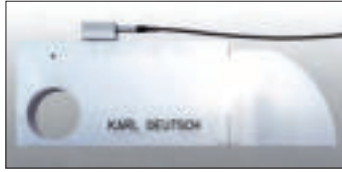
Calibration block no. 1