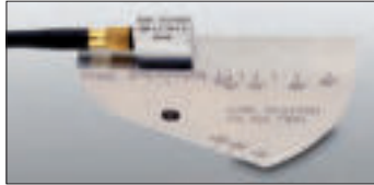
Calibration block no. 2

The calibration blocks are indispensable for the adjustment and check of ultrasonic instruments: