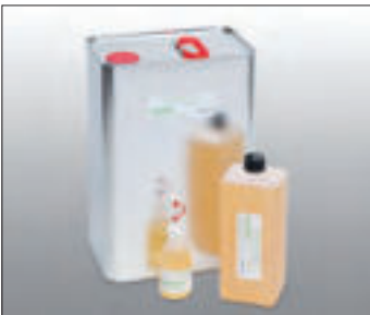
ECHOFLUID is especially suited for higher test frequencies and for wall thickness measurement

The couplant ECHOTRACE is a water-based gel with ideal ultrasonic properties and achieves better acoustic coupling compared to e.g. oil, grease or water. It contains anticorrosives, is dermatologically neutral and non-inflammable.