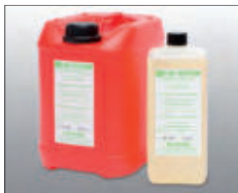
Package examples for ECHOKOR