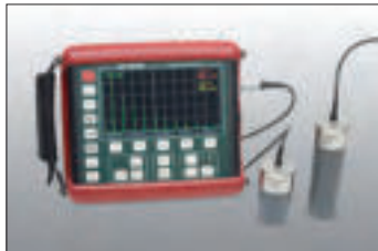
Adjusting standards with echo sequences of 50 mm and 100 mm