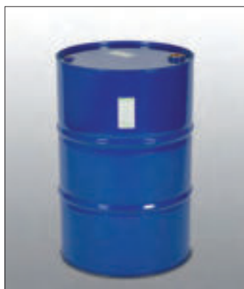
If large quantities are needed ECHOKOR and ECHOKOR LF are also available in 200 l barrels.

Water is an ideal couplant, however, it causes corrosion of test objects and test equipment.