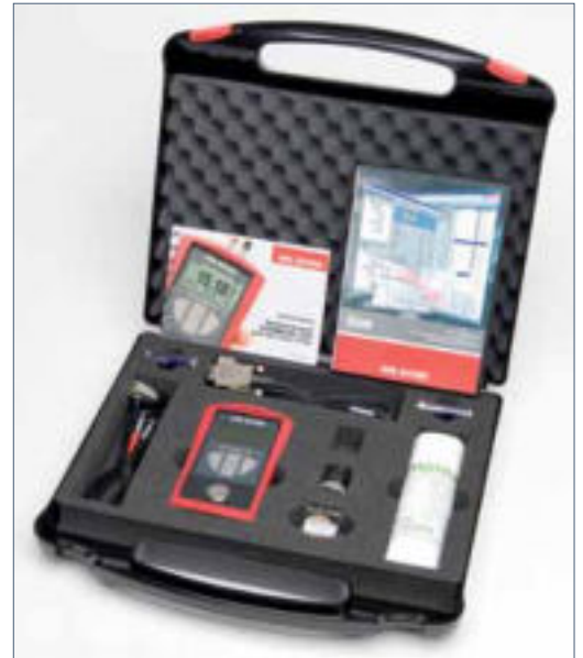
Delivery in a handy carrying case