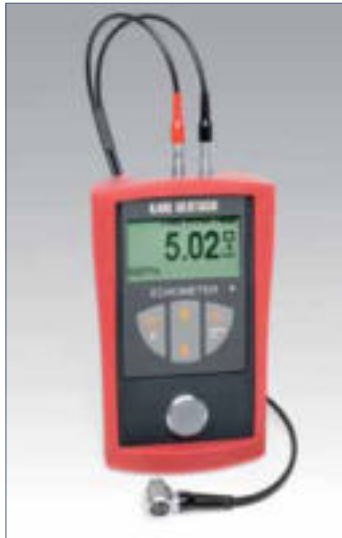
Large, clear graphic display with bright background illumination