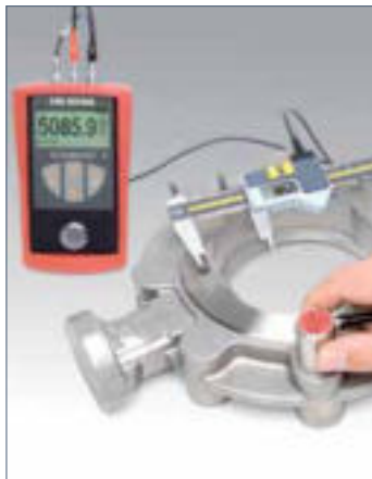
Measurement of sound velocity with connected caliper for automated input of the wall thickness value