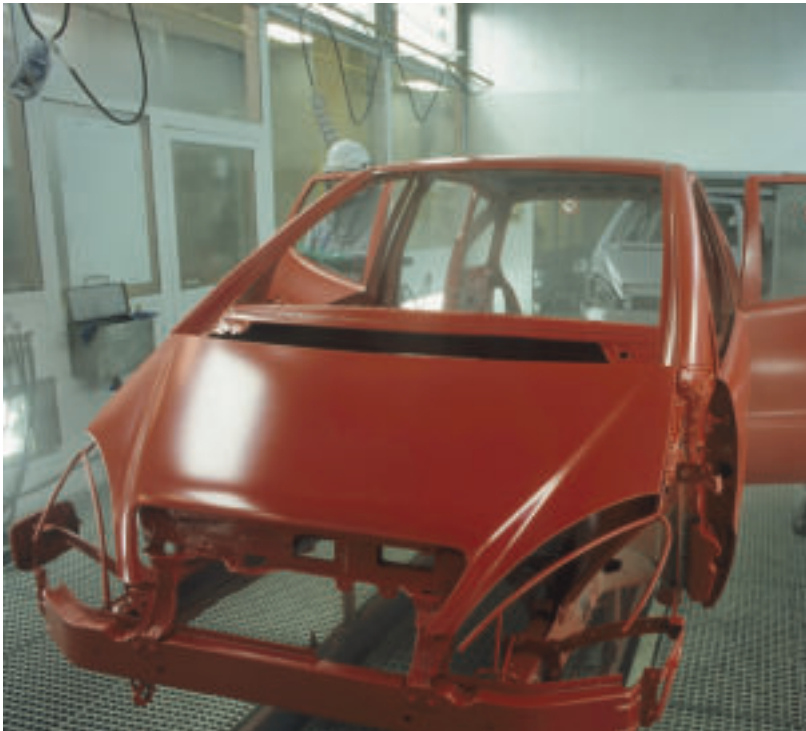
Car body after the painting process