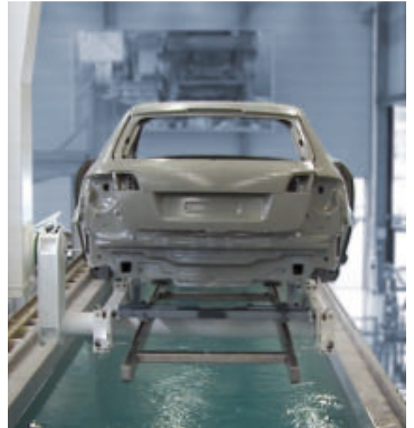
EPD painting process