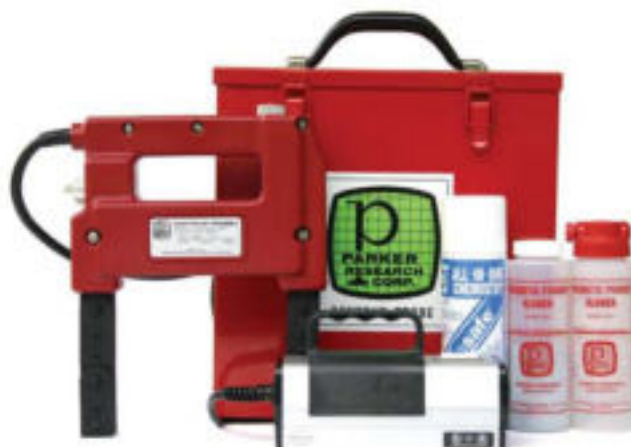
DA-400 SHOWN WITH "A/B" KIT ITEMS

WIDE VERSATILITY Mechanical flexibility plus selectively controlled solid state electronic features permit a vast field of applications. Mechanically, the Probe will conform to practically any surface configuration. The unique electronic circuitry contained in the molded handle permits selection of a strong constant AC magnetic field, or high intensity pulsed DC field.