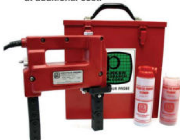
DA-400 SHOWN WITH "A" KIT ITEMS

Kit items are available with dry powder and Wet Fluorescent inspection mediums. Including Black Light and Steel Carrying Case.