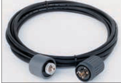
MA-7RC Remote Switch Assembly (20')