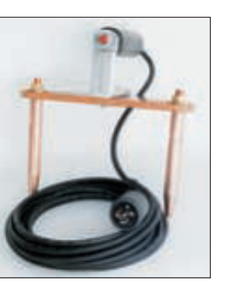
MA-7001 Dual Horizontal Prod Assy (adjustable tips)