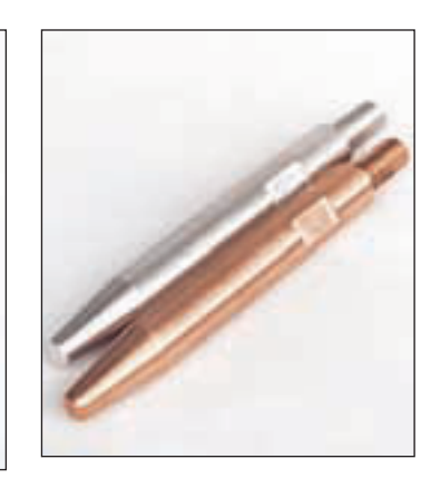
MA-7ST Replacement Prod Tips (aluminum or copper)

PARKER RESEARCH CORP. P.O. BOX 1406, DUNEDIN, FLORIDA 34697 USA Phone: (727) 796-4066, Fax: (727) 797-3941