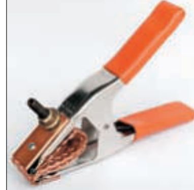
MA-7003 Braided Contact Clamp (3 inch Grip)