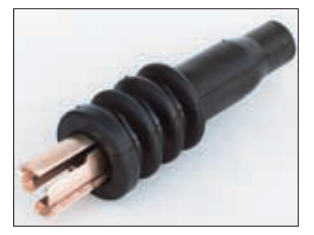
MA-7EC 4/0 Eitherend Connector