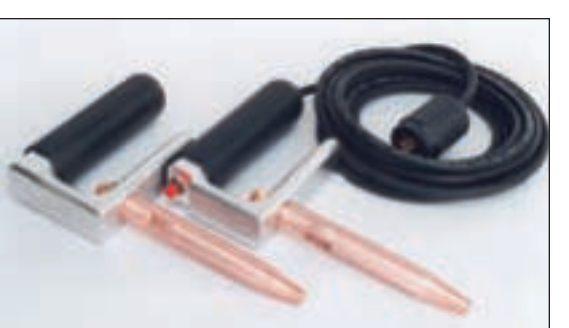
MA-7000 Individual Prods (set of 2)