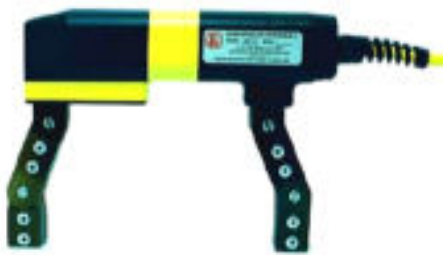
Figure 1: UW-12 / UW-115

DESCRIPTION: The Parker underwater Contour Probes are electromagnets capable of inducing a strong magnetic field in ferromagnetic materials for the purpose of performing Magnetic Particle Inspections. The UW-115 produces an A.C. magnetic field from a GFI protected 115VAC power source. The UW-12 produces a D.C. magnetic field from a 12V battery or 12VDC power supply.