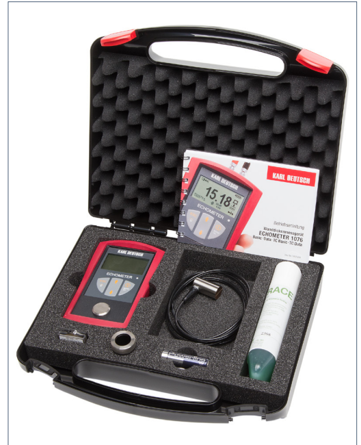
Delivery in a handy carrying case