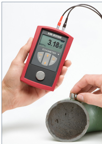
Wall thickness measurement on a tube using the miniature probe