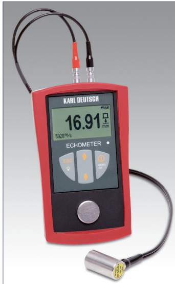
Large, clear graphic display with bright background illumination